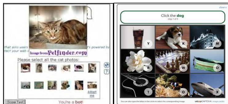
Figure 2: Image-Based CAPTCHA

Image-based CAPTCHAs: Image-based CAPTCHAs like Image Block Exchange [14] and Face Recognition [15] Captcha generally rely on image classification where users are presented with a series of images and asked to identify the relationship between them. One such CAPTCHA is ESP-PIX, which displays four images and asks users to select a common description from a drop-down list [16]. Since the image categories are selected from a fixed list, there is a high likelihood of random guessing yielding a correct answer. The Asirra image-based CAPTCHA uses a closed database of animals from Petfinder.com [17]. Users are asked to select all images of cats from a mixed set of 12 cats and dogs drawn from a large source database of over 3 million images. Samples of some image-based CAPTCHA techniques are shown in Figure 2.