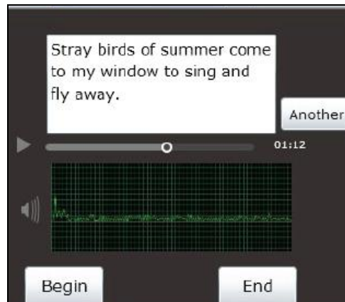
Figure 3: Audio Based CAPTCHA

Audio-based CAPTCHA: For visually-impaired users, some websites have developed audio-based CAPTCHAs. These generally work by playing a recording of a set of words or characters with users being asked to type-in what they hear. Unfortunately, these CAPTCHAs are subject to attacks using speech recognition software [18]. Eco [19] is one such system. Nancy Chan of the City University in Hong Kong has also implemented a sound-based system of this variety [20]. Haichang Gao [21] proposed a new audio CAPTCHA which exploits the gaps between human voice and synthetic voice. Sample of Audio-based CAPTCHA technique is shown in Figure 3.