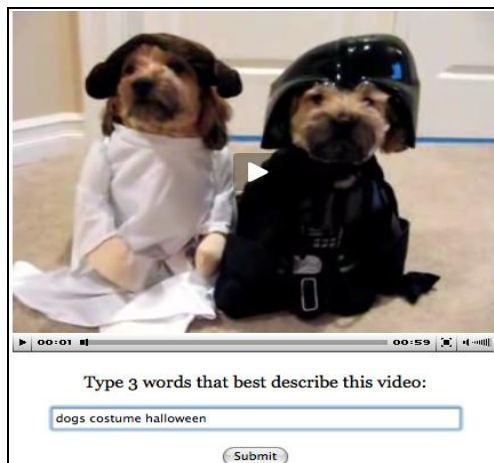
Figure 4: Video Based CAPTCHA

Video-based CAPTCHAs: These CAPTCHAs use videos rather than static images or text. In one such CAPTCHA, users are shown YouTube videos and asked to tag them with descriptive keywords. In tests, humans achieved 90% accuracy while computer attack rates were approximately 13%. Sample of video-based CAPTCHA technique is shown in Figure 4.